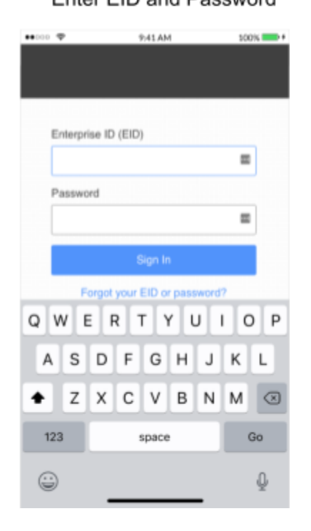
Enter EID and Password